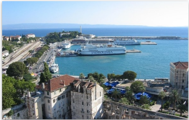
Split Ferry Port