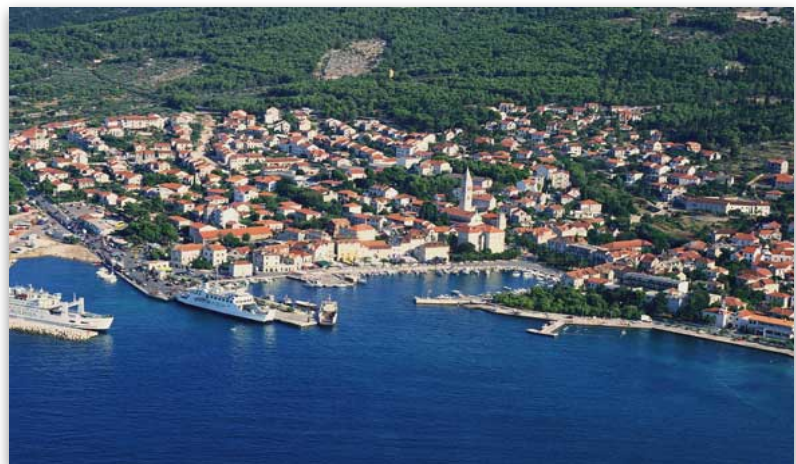
Arriving Supetar Harbor